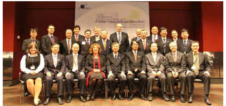
2009 Annual Summit in Munich, Germany